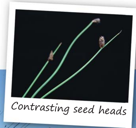
Contrasting seed heads

from fully exposed seaside aspects will benefit it's overall appearance. Twizzler will grow in dry land gardens provided it gets occasional summer watering. Outstanding results will be achieved when planted in moist to wet soils and in water to 200mm deep. It will grow in inland climates but needs to be protected from heavy frost.