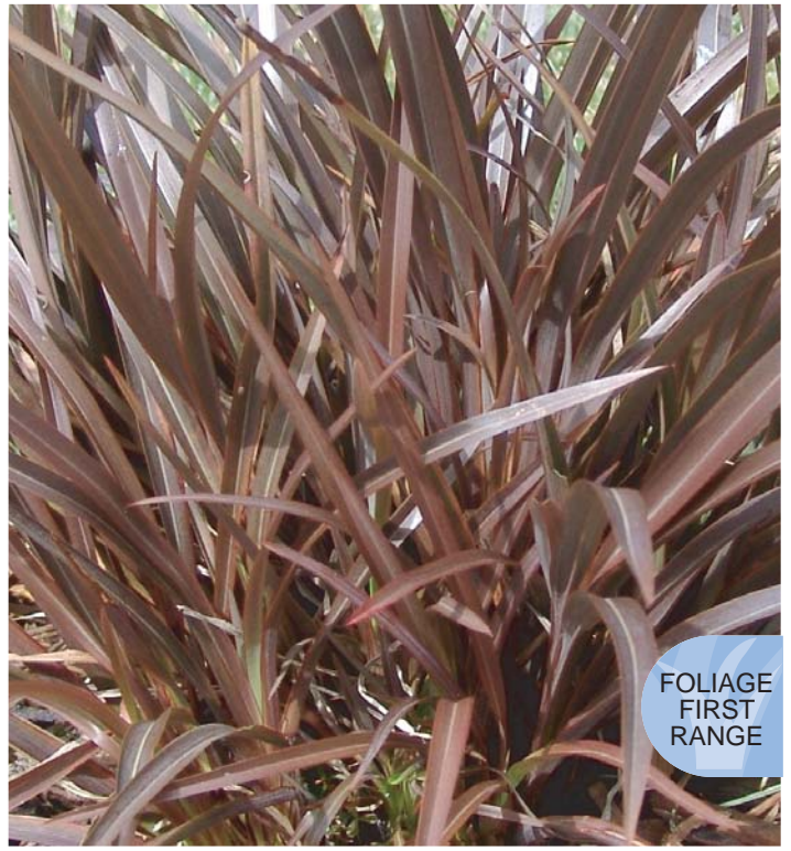
FOLIAGE FIRST RANGE

Sweet Mist is ideal for mass planting as a low border or fill in plant and an excellent choice for contrasting with green foliage. Suited to the smaller modern garden. It is also good for containers and patios. Sweet Mist grows well in full sun to shaded positions, tolerates heavy frost and moderately dry conditions and is suitable for most soil types.