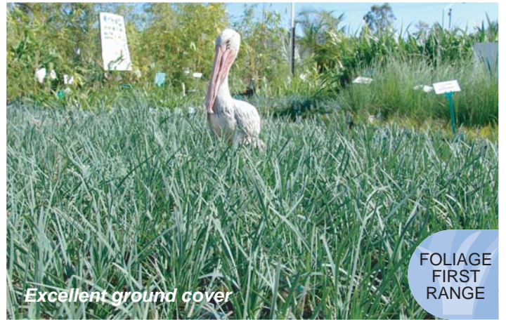
Excellent ground cover