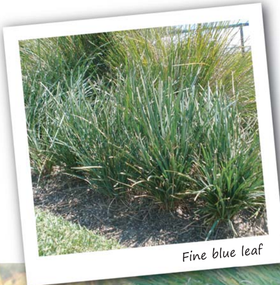
Fine blue leaf