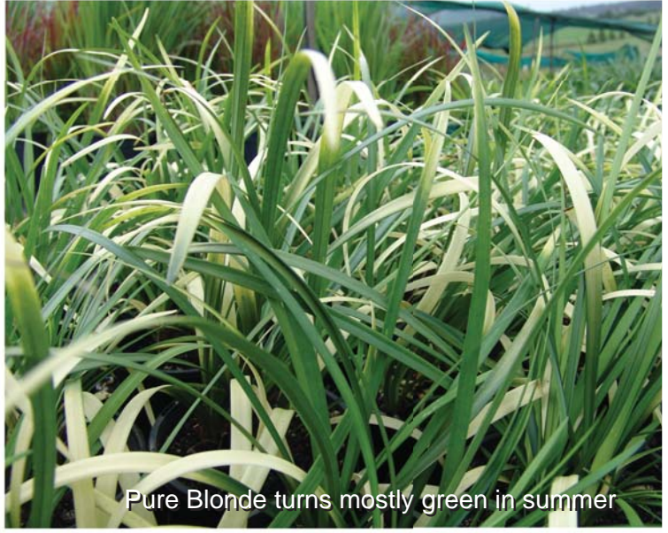
Pure Blonde turns mostly green in summer