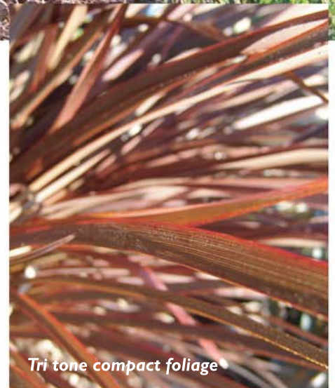
Tri tone compact foliage

Flamin' is a semi compact Phormium, with red, orange and bronze tones. Flamin' grows well in full sun to shaded positions. It tolerates heavy frost and moderately dry conditions. Flamin' is low maintenance once established.