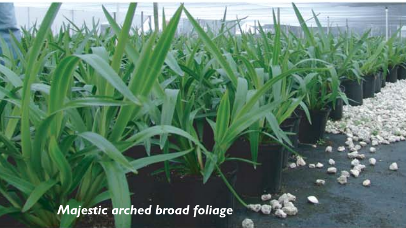
Majestic arched broad foliage

Emerald Arch is an ornamental Flax Lily distinguished by its majestic arching leaves. Suitable for shade in all states and full sun in all states except Queensland.