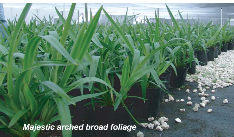
Majestic arched broad foliage

Emerald Arch is an ornamental Flax Lily distinguished by its majestic arching leaves. Suitable for shade in all states and full sun in all states except Queensland.