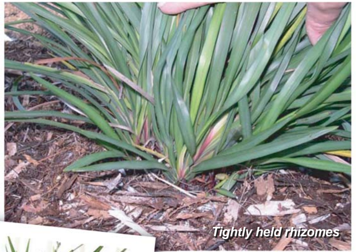
Tightly held rhizomes

Aranda is a compact, dwarf, cane less Dianella with upright to slightly arching deep green foliage and has very tight rhizome growth with a small spread. Aranda has a more or less clumping habit. It has smooth deep green semi gloss, gently arching foliage. It flowers in spring and summer with deep blue coloured flower buds and star shaped flowers held among to slightly above the foliage, this is followed by purple berries. Grows in full sun to 70% shade and grows well in coastal humidity and inland climates. Full frost tolerance yet to be tested. It has shown evergreen frost hardiness to -5°C in Windsor, NSW, with only some leaf discolouration.