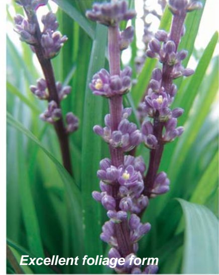
Excellent foliage form

humid regions, and bitterly cold areas. In colder climates like Melbourne, Canberra or Christchurch, it is a good idea to trim the foliage back each year in mid to late winter, allowing the crisp new shoots to emerge without the clutter of older leaves. On larger projects this may not be possible, but don't worry, by spring or summer the new clean foliage will dominate the old foliage, giving the plant a refreshed look.